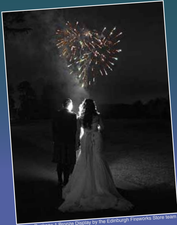
Photo: Package 1 Bronze Display by the Edinburgh Fireworks Store team