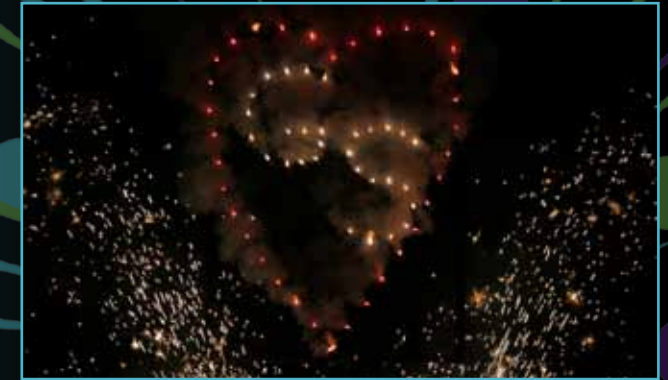
Photo: Initials 'G' & 'S' in a love heart with fountains

It is a static set piece that sits about 2m above ground level and burns for almost 1 minute. The frame is over 1m tall by 1m wide and is not to be confused with cheaper, smaller imitation products. Each set piece is custom made by hand. This will make your show stand out from the rest.