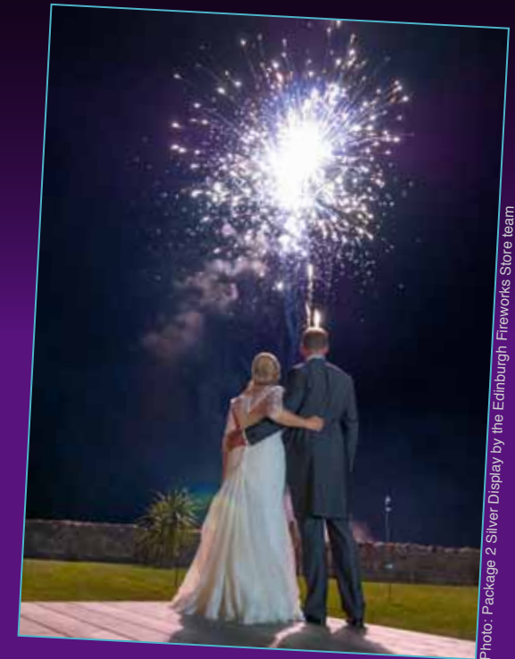
Photo: Package 2 Silver Display by the Edinburgh Fireworks Store team